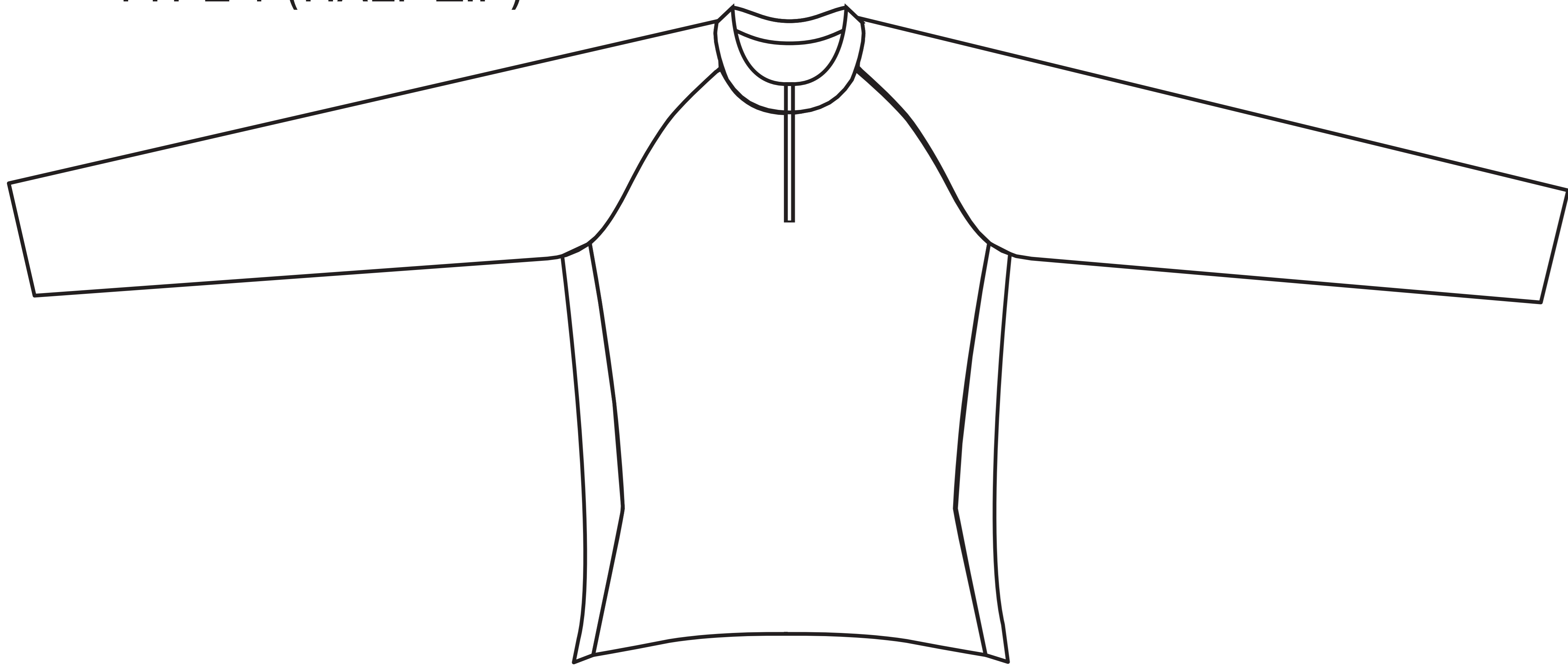
TYPE 1 (HALF ZIP)

email - trcyclingwear@gamil.com / kakao - gloriasports / tel - 02-2236-4069 Line 1